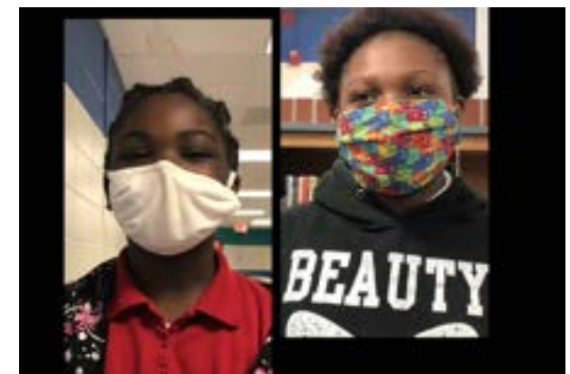
Students singing music notes for the recording.