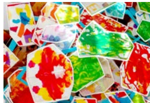
Close-up of windows created by the students.

The collaborative art installation designed by Davis and Inger combined student artwork and sound recordings to create “vibrations” to build community and positive thoughts. Through the merging of real and virtual communication techniques, the artists composed a unique experience that captured the imaginative elements of clouds and vibrations. Cloud Vibrations was on display from December 19, 2020 to January 23, 2021. When Cloud Vibrations visitors approached the Re:Public building to view the collection of student artwork through the artspace windows, a motion sensor activated audio and video recordings from over 200 students singing individual notes on a video screen.